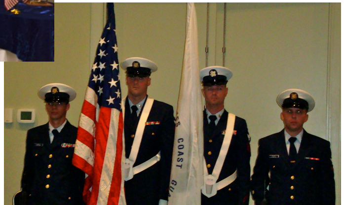
Our Color Guard- Coast Guard Cadets