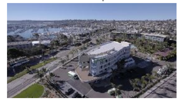
This is the Harbor View Room/ Hospitality Room