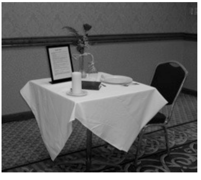
Our POW/MIA table at memorial lunch

Our Color Guard for the Memorial Service. They did an outstanding job as well as our bugler.