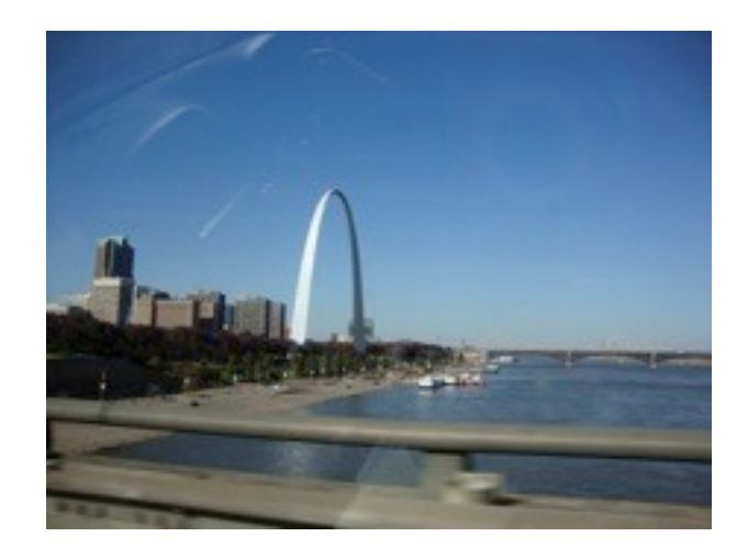
The St. Louis Arch