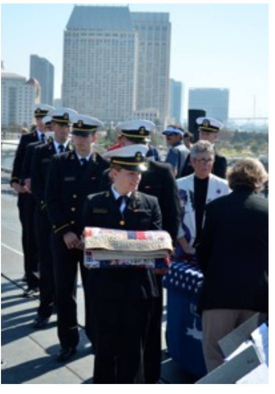
Navy Midshipmen preparing to present Quilts to the survivors at the Memorial Service October 25, 2014.

Stack of Quilts at 2014 Memorial Service